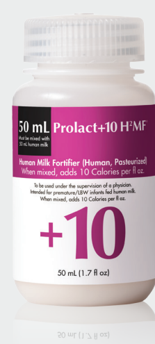
Human Milk-Based Human Milk Fortifier Prolact+ 10 H 2 MF® 30 Cal/fl oz. 104 kcal/100 mL