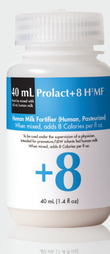
Human Milk-Based Human Milk Fortifier Prolact+8 H 2 MF® 28 Cal/fl oz. 97 kcal/100 mL