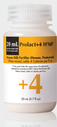
Human Milk-Based Human Milk Fortifier Prolact+4 H 2 MF® 24 Cal/fl oz. 82 kcal/100 mL