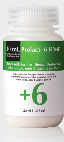
Human Milk-Based Human Milk Fortifier Prolact+6 H 2 MF® 26 Cal/fl oz. 89 kcal/100 mL